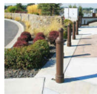
Bollard Detail THESE BOLLARDS WILL BE INSTALLED AT THE ENTRANCE TO THE MOOTH GARDEN AND AT THE ENTRANCE TO THE EXISTING DAIRY BUILDING. THE BOLLARDS WILL BE 12" DIA. X 36" HIGH AND WILL BE MADE OF POLYETHYLENE GLYCOL (PE) WITH A SAND FILLING. THE BOLLARDS WILL BE SPACED AT 10' ON CENTER.